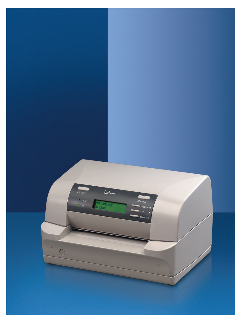
The PR 9 is the efficient solution for fast and reliable document printing.